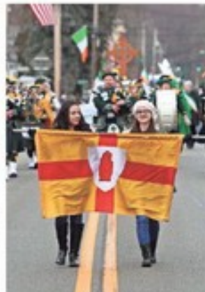
A scene from the 24th annual Dutchess County St. Patrick's Day Parade.