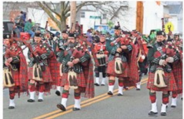
A scene from the 24th annual Dutchess County St. Patrick's Day Parade in Wappingers Falls.

Jack Howland: jhowland@poughkeepsiejournal.com , 845-437-4870; Twitter: @jhow104 .