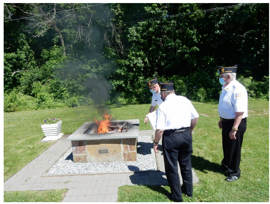
More photos at <u>https://al-ny1758.org/2020-civic-events#FlagDay</u>