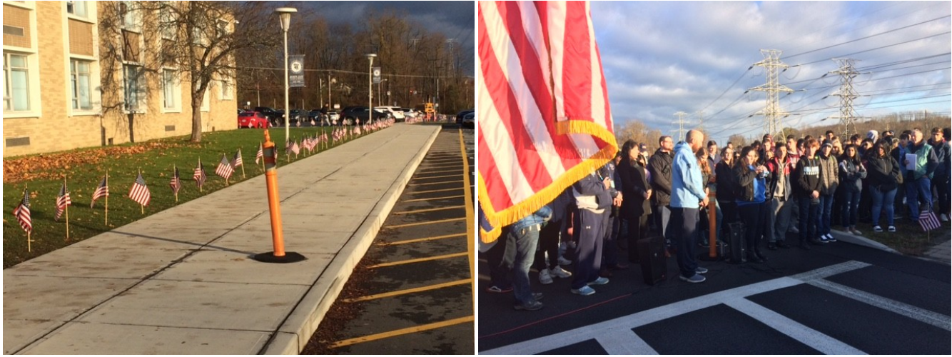
More photos at <u>https://al-ny1758.org/2019-civic-events#JohnJay</u>