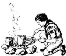
Boy Scouts and Venture Crew

We secured a listing of Post 0001 members living in the East Fishkill area, as Department said it was a good way to boost membership. Then, it was decided that the "transmittal" form had to have a member's signature to show he was willing to transfer to a local post. A separate letter, signed by the transferring member, was deemed good enough to pass the willingness test. But, Department decided, not right now. At least not in batches. So, from 28 or so letters sent out to prospective transferees, 11 or 12 came back showing interest. The names, signatures and transmittal forms were sent to Albany, where accuracy will be decided. Currently, the post is at 65% of the members having renewed for 2017.