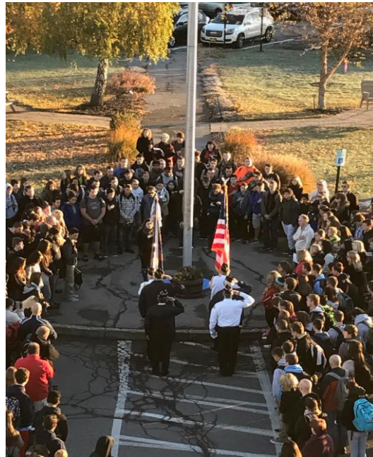
On the right, the large crowd takes part in the Pledge of Allegiance to start the ceremony in front of John Jay High School, Hopewell Jct., NY on 10 November 2016.