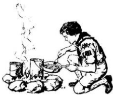
Boy Scouts and Venture Crew