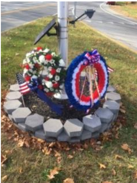
Two wreaths at the Hyde Park Veterans Memorial. The one on the right is from the County to the Veterans of the County and town of Hyde Park.