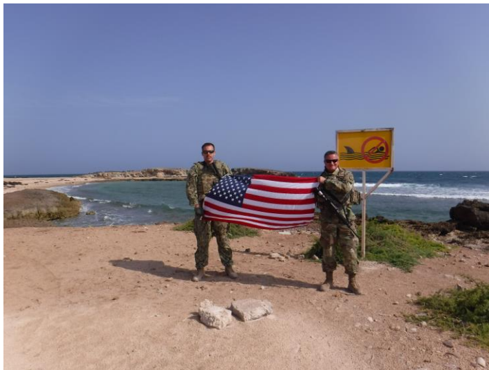
Our American Flag is on display on a beach in Somalia...