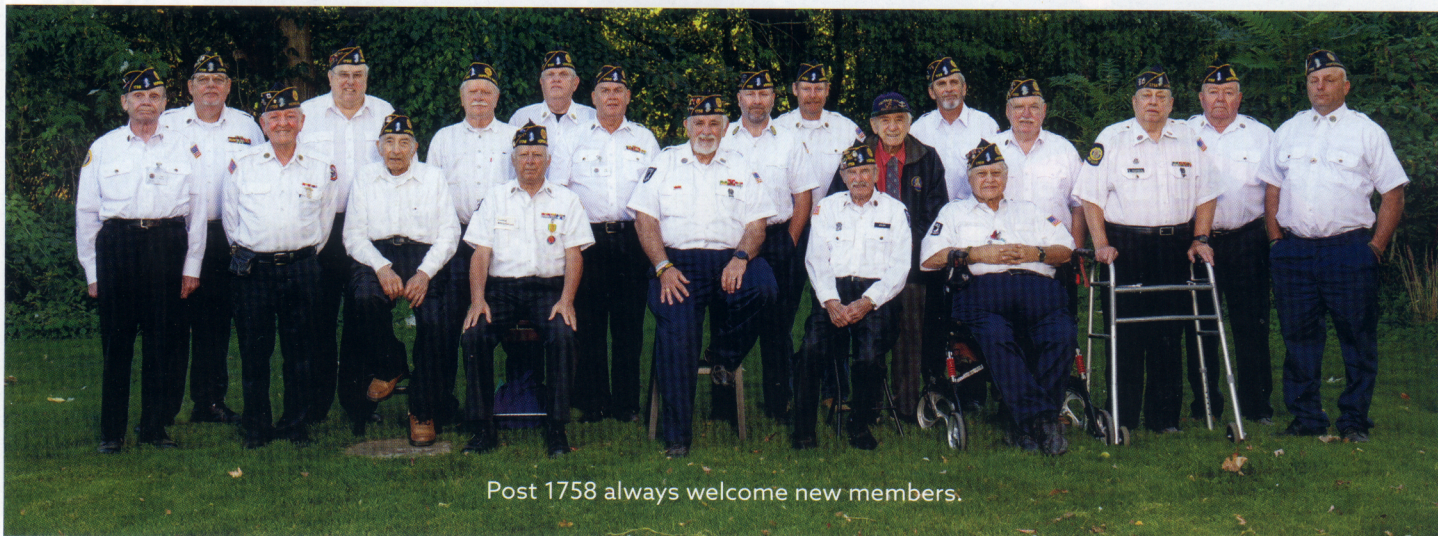
Post 1758 always welcome new members.