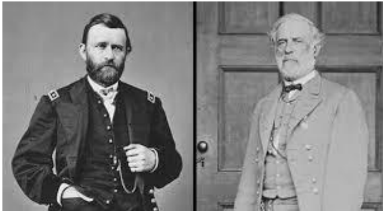
Ulysses S. Grant